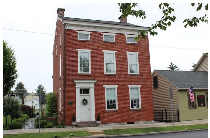
Henderson House, 31 E Main St, Hummelstown

As always, all Chapter members are welcome to attend our BOM meetings and get involved in the Chapter's activities. The address of the Henderson House is 31 East Main St in Hummelstown. Parking is available along Main St and a public parking lot is a house away from the building. Meeting times will remain at 9:00. See page one for meeting dates. Our next meeting is March 3.