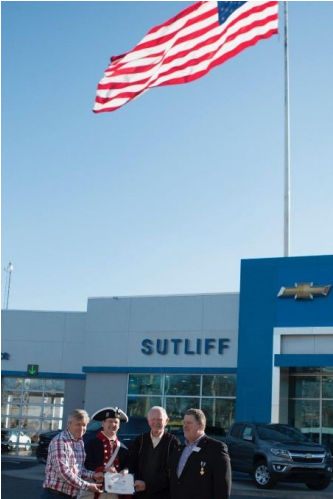
American Flag flies proudly over the Sutliff Chevrolet dealership in Harrisburg