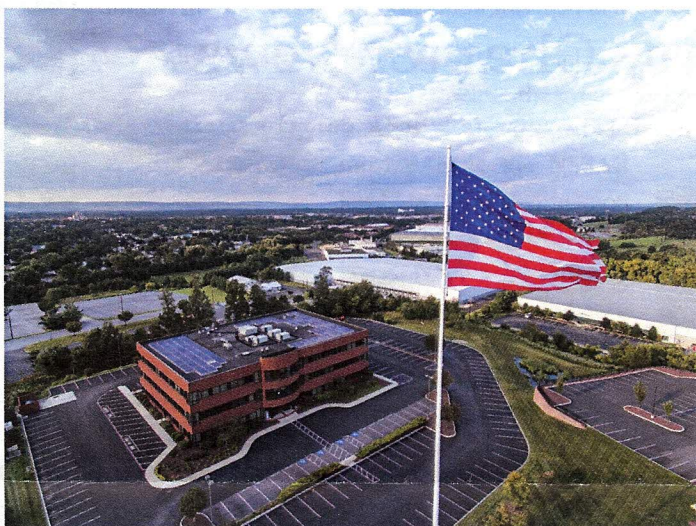
American Flag flies proudly high over 4550 Lena Drive in Mechanicsburg