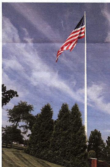
4550 Lena Drive in Mechanicsburg