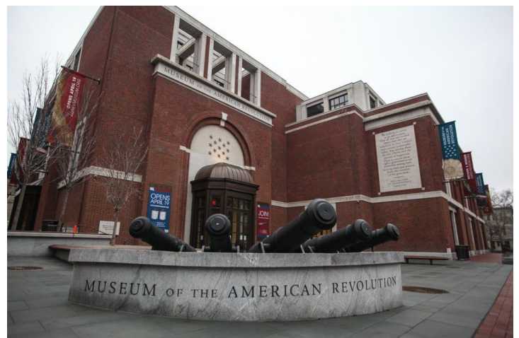
Museum of the American Revolution, Philadelphia, PA